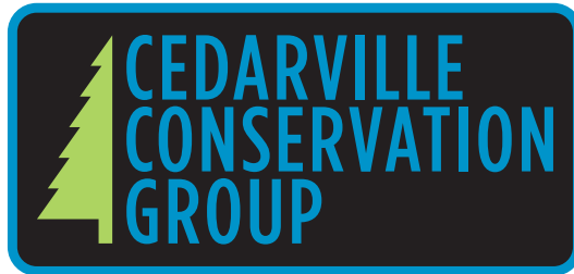
2.75" W WOVEN LABEL PATCH PMS 367 PMS 639 BLACK